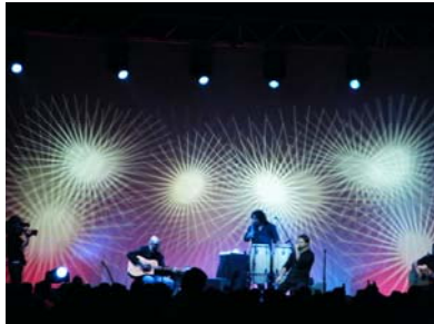
Let the music play